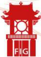
FIG WORKING WEEK 2019