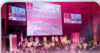
FIG Congress celebrated its silver jubilee

global provider of wireless data and location-based solutions, today announced the incorporation of Novatel Wireless' integrated product line with Racowireless' Position Logic platform, providing a full, end-to-end aftermarket telematics solution for LATAM markets. www.nvtl.com