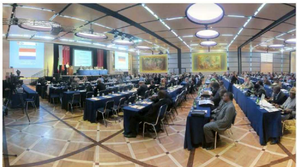
▲ The General Assembly during the FIG Working Week in Rome, Italy.

The Voluntary Guidelines on the Responsible Governance of Tenure of Land, Fisheries and Forests in the Context of National Food Security were adopted by FAO immediately after the FIG Working Week 11 May 2012. Land and natural resources are under threat worldwide. Good and