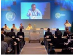
Celebrating the 2nd anniversary of UNGGIM