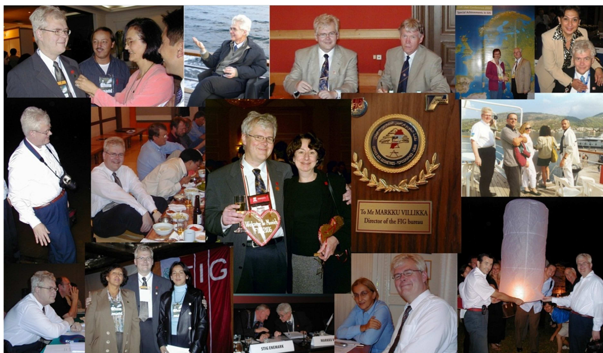
FIG Pacific Small Island Developing States Symposium – 18-20 September 2013

http://www.fig.net/news/news_2013/mv_resign_aug_2013.htm