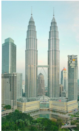
The impressive Petronas Twin Towers in Kuala Lumpur, Malaysia.