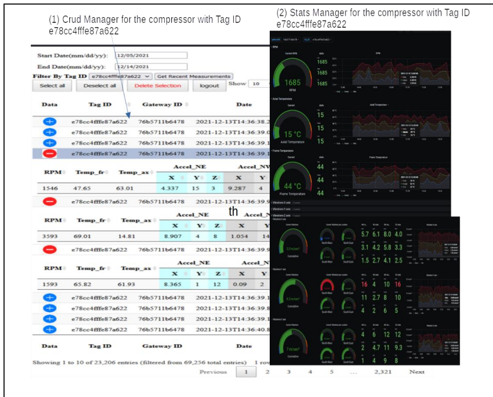
Figure 6. Compressor sensory component Stats Manager and CRUD Manager output.

An important piece in this intelligent and predictive maintenance architecture is the decision support system for maintenance technicians during maintenance interventions. This smart decision support system, called IAgent, articulated with human-machine interaction technologies, e.g. augmented reality, contributes to a faster and more efficient reaction and recovery of the failure occurs when compared to paper procedures. Its core functionality is the deprivation of critical assets malfunctions by providing prior information using a per asset sensory equipped part predictions of probable malfunctions.