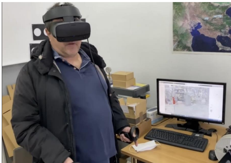
Figure 4. Virtual reality with Oculus Rift S during the survey of a compressor

In this study, the 3D point cloud of each survey has been extracted to a specific e57 format file, a compatible format for FARO SCENE lite viewer. Then, each derived point cloud was then transformed into a compatible virtual reality scene (see Figure 4), using the previously mentioned software package. Finally, the user can interact with each 3D object using the oculus Rift controllers and collect valuable asset information.