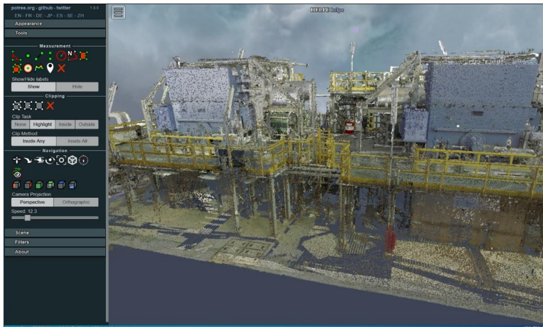
Figure 1. 3D point cloud view of a CCR unit using Potree environment