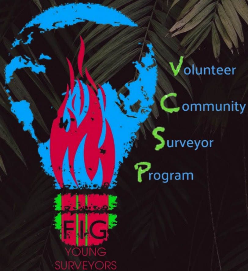
FIG Volunteer Community Surveyor Program