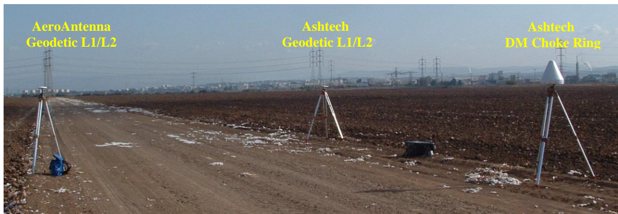
Figure 1 – GPS day 301, three GPS antenna types set up on a flat open field at a height of approx. 1.6m.