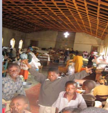
EILAT 2009 POST ELECTION VIOLENCE ITS IMPACT ON INFORMAL SETTLEMENTS IN KENYA