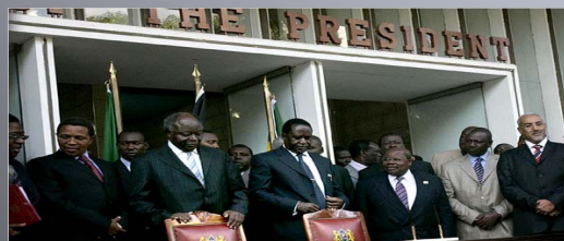
EILAT 2009 POST ELECTION VIOLENCE ITS IMPACT ON INFORMAL SETTLEMENTS IN KENYA