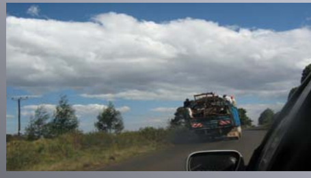
EILAT 2009 POST ELECTION VIOLENCE ITS IMPACT ON INFORMAL SETTLEMENTS IN KENYA