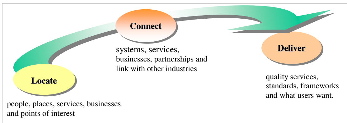
Figure 1: Locate, connect and deliver spatial information

In this regard, in modern society, spatial information is an enabling technology or an infrastructure to facilitate decision making. Spatial information can be a unifying medium in which linking solutions to location. According to Victorian Spatial Information Strategy (VSIS 2008), user demand has shifted to seeking improved services and delivery tools. This will be achieved by creating an environment so that we can locate, connect and deliver as illustrated in Figure 1.