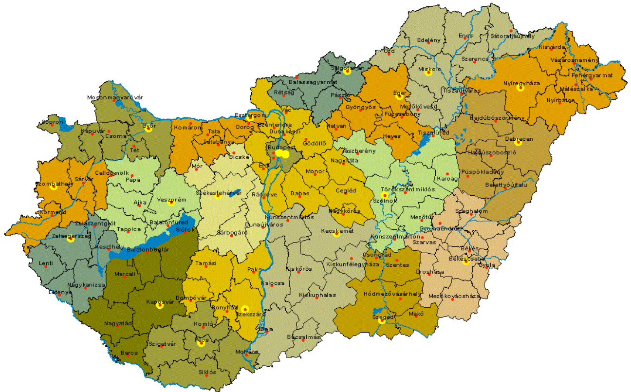
County Land Offices and District Land Offices in Hungary