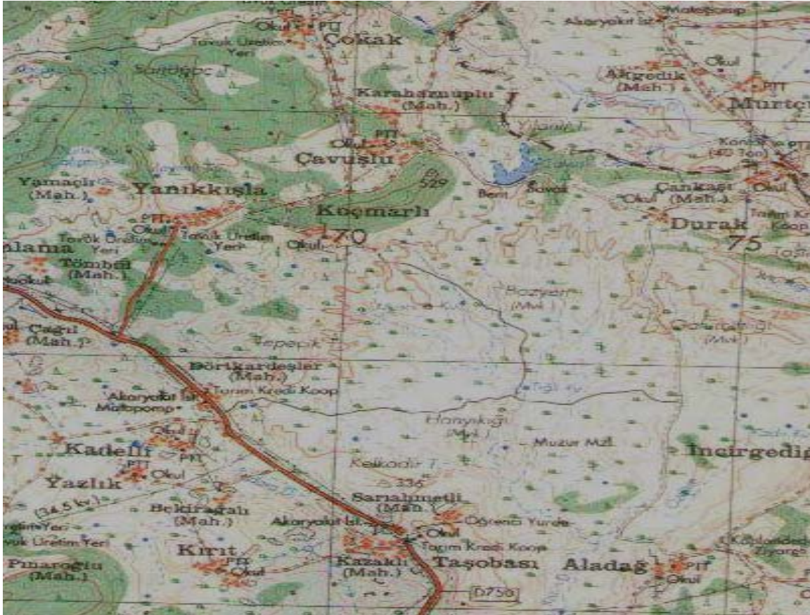
Figure 2. Irrigation area

All kinds of agriculture products from these fertile lands and the abundance of raw materials for industry, has played the most important role in development of the industry.