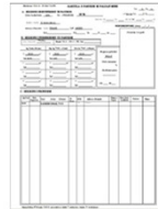
➤ Ownership file