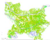
➤ Vector map