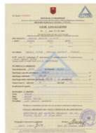
➤ Title of ownership