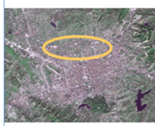
➤ Informal zone