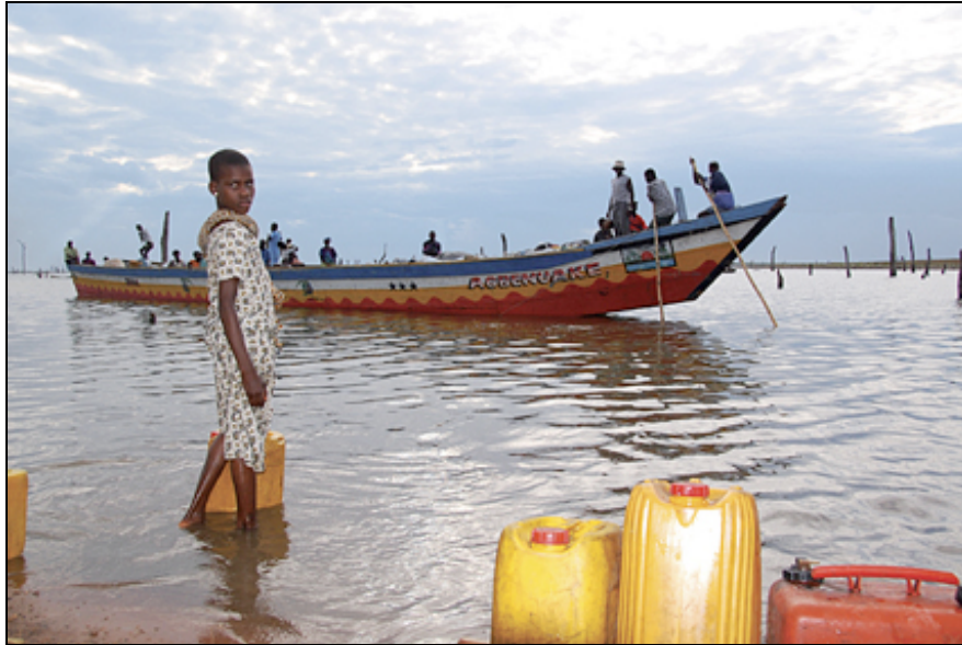
Fig. 8- A motorist canoe carrying passengers, food etc navigating around tree stumps

The objective above defines a clear indication that developing the water bodies to be used for transportation would bring about a vast improvement in the transportation system of the country.