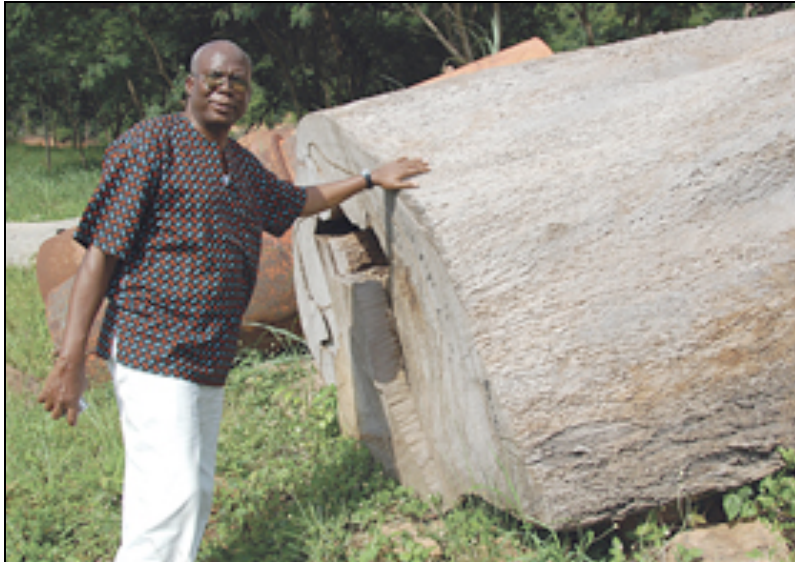
Fig. 7- a mahogany tree that was pulled from Volta Lake

destruction of existing forest and, according to Wayne Dunn, "could generate the largest source of environmentally sustainable natural tropical hardwood in the world [4]. This underwater forest activity will make the lake more navigable and safe and could generate the largest source of environmentally sustainable natural tropical hardwood in the world.