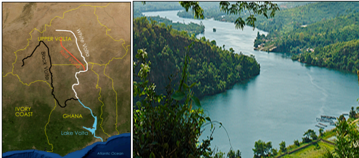
Fig. 3- The Volta River and the Three Main Tributaries

The Volta River is the main fresh water source for Ghana. It is a stream primarily in Ghana that drains into the Gulf of Guinea and Atlantic Ocean and has three main tributaries—the Black Volta, White Volta and Red Volta [Fig. 3]. The Volta River is formed by the confluence of the Black Volta and the White Volta rivers at Yeji in the central part of the country [7]. The river flows in a southerly course through Lake Volta to Ada on the Gulf of Guinea. The total length, including the Black Volta is about 1,500 km (930 miles).