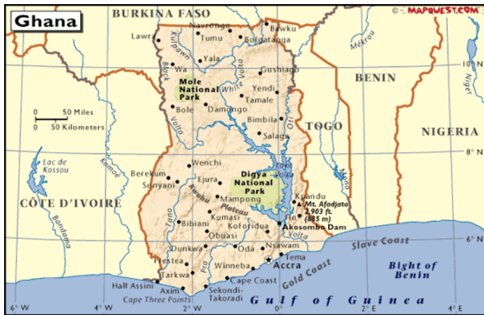
Fig. 1 Map of Ghana showing the Lake

land, 3 hours, majority of travelers would prefer to use the land due to fear in the use of the water body.