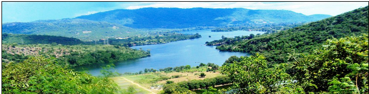
Fig. 4- Panorama and landscape of Lake Volta in Ghana

Along this river and the coast are towns, communities, villages that depend on the use of these water bodies for their livelihood and business activities [Fig. 4]. The use of fishing canoes and small boats have been the available mechanism for transporting people and goods which has endangered lives over the past periods due to unavailability of safety measures. For this reason, many people have avoided the use of water bodies for transporting them from one place to another.