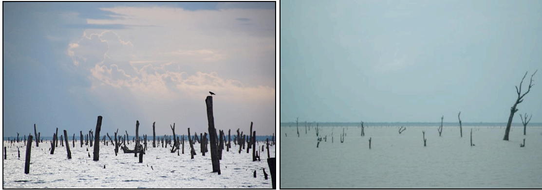
Fig. 5- Hard wood trees and tree stumps left standing in the Volta River