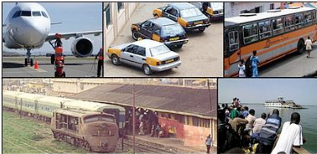
Fig. 2 Transportation in Ghana

Increased transport investment helped to increase the number of new vehicle registrations and transportation alternatives include rail, road, ferry, marine and air [6]. There has been an increased investment and expansion in the road transportation of Ghana [1], hence with respect to this mode of transport, many people prefer to use the road means of transport for their movements than the use of the other transportation alternatives.