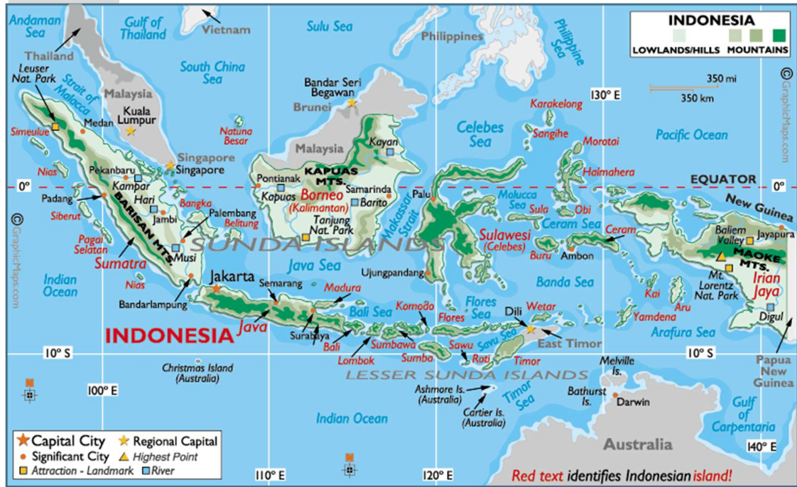
XXV International Federation of Surveyors Congress, Kuala Lumpur, Malaysia, 16 – 21 June 2014