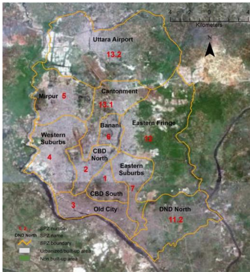
Map 1: Strategic Planning Zones (SPZs) of Dhaka