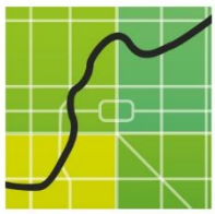
FIG Working Week 2016