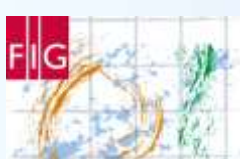
FIG WORKING WEEK 2017

Surveying the world of tomorrow – From digitalisation to augmented reality