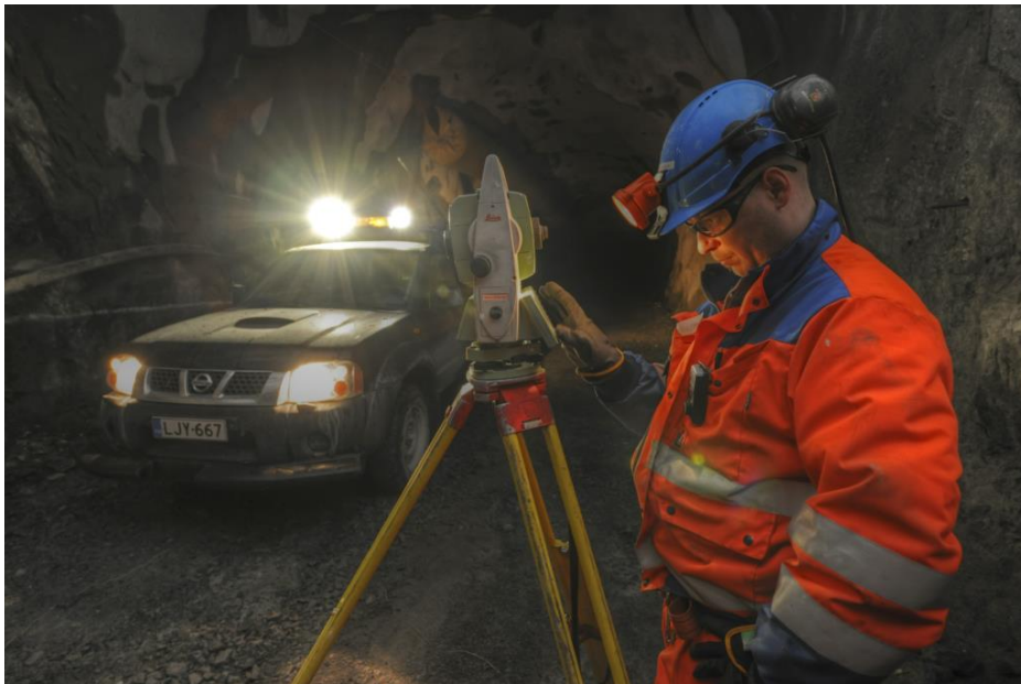
Figure 2. Surveying underground in Kittilä mine (Agnico Eagle 2018b).

Mine surveyors use quite conventional surveying practices, but their working environment is very different from other land surveying (figure 2). It is more demanding to work in busy mine than under peaceful open sky. Mine is a constantly changing working environment. A place that was safety previously can be dangerous next time. Air humidity, dust and gases, even dangerous gases like carbon monoxide (CO), create problems for workers, instruments and machines. Traffic is also a major challenge in mines. Mine surveyors have to be creative with traffic related problems when they plan and perform their measurements. (Alatalo 2017.)