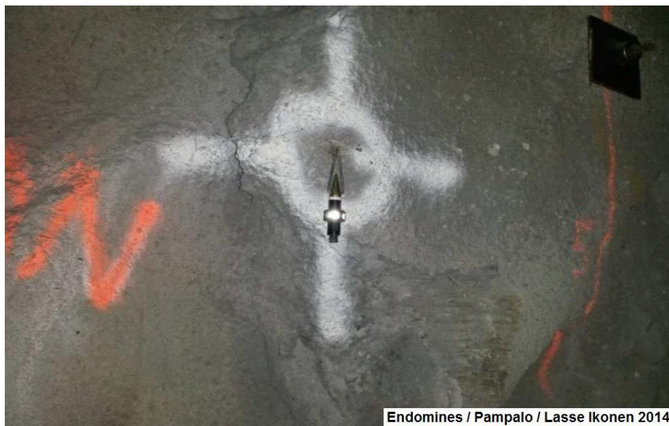
Figure 4. Wall control point in Endomines' Pampalo mine (Ikonen 2014).

For example, in Kittilä mine, the control network is extensive. There is a sparse primary control network on the ground, which dates back to 1980's. The primary points defines the reference frame to be the old Finnish national frame, which is not used anymore. The control network continues from the ground through the entrance tunnel and advances along the tunnels to everywhere in then mine, so that there are about 1500 secondary points located on the walls of the tunnels at about 100 m intervals (figure 4). In addition there are approximately the same number of auxiliary points for short term use. Because of the tunnel network expands and mining operations and traffic destroys control points, mine surveyors have to do control surveys continuously. (Alatalo 2017.)