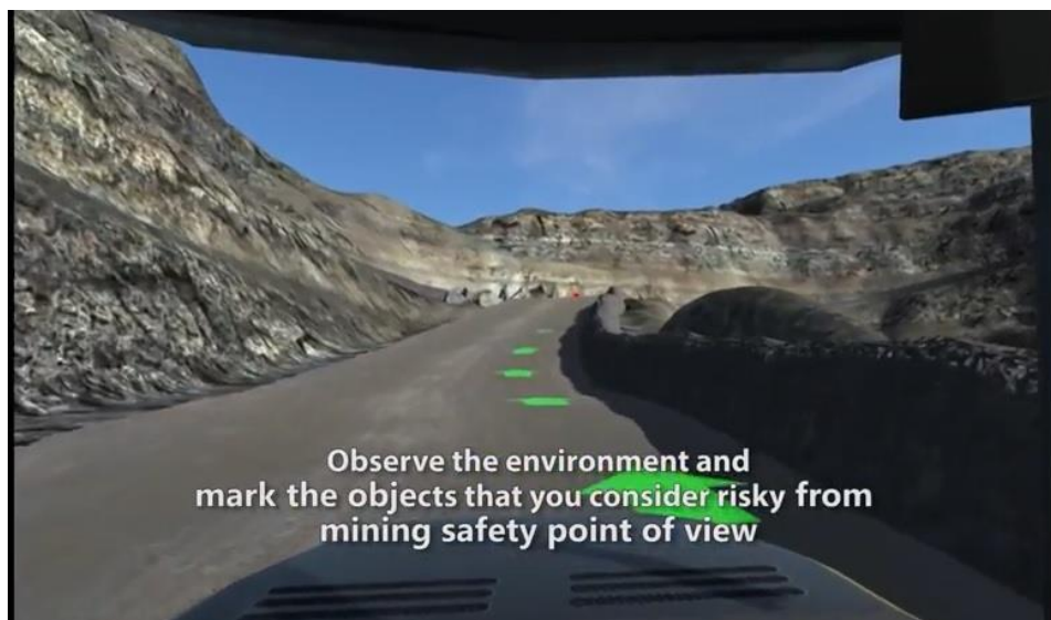
Figure 3. Hazard inspection scenario implemented in the virtual model of existing open pit mine in Siilinjärvi. (KaiVi 2016.)

Lapland and Kajaani universities of applied sciences have worked together to develop engineer education in the mining sector for many years. The cooperation has confirmed their role as key providers of engineer education on bachelor level in Eastern and Northern Finland. There have been several development projects. One of the projects has been a virtual learning environment for mining (KaiVi). It is a simulation based, game-like learning environment. It allows for the visualization of the activities and decision-making with cause-effect relationships in mines that are difficult or impossible to do without a virtual environment. The training environment can be utilized in various fields of education, such as infrastructure, maintenance, mechanical engineering, construction engineering, electrical engineering, and automation. The students will learn to work together in a multidisciplinary mining environment. This will improve their readiness to work in mines safely. (Figure 3.)