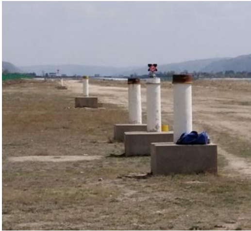
Figure 1 Baseline stations