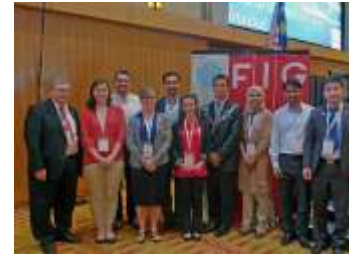
XXV FIG Congress Kuala Lumpur, Malaysia