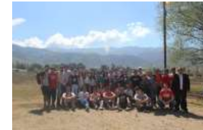
6th National Meeting of Surveying Students Tucuman, Argentina