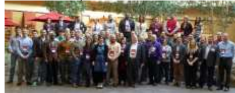
2nd FIG Young Surveyors North American Meeting Minneapolis, Minnesota USA