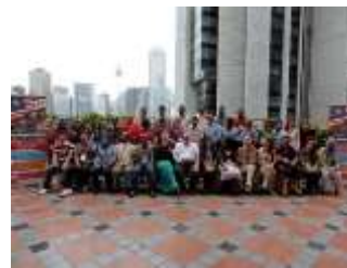
STDM Training Kuala Lumpur, Malaysia