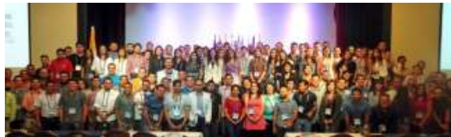
XIV International Congress of Topography, Cadastre, Geodesy and Geomatics San José, Costa Rica