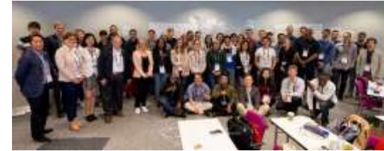
5th FIG Young Surveyors European Meeting Helsinki, Finland