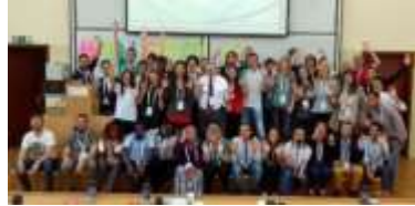
3rd FIG Young Surveyors European Meeting - Sofia, Bulgaria