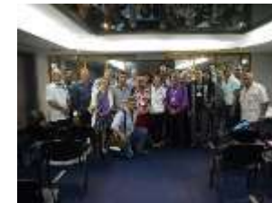
VIII Convention of Surveying Havana, Cuba