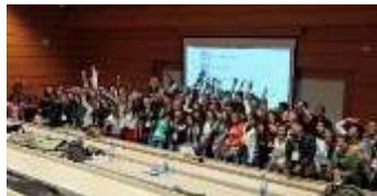
X National and VII International Congress of Surveying Bogotá, Colombia