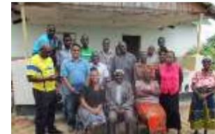
VCSP Volunteer Community Surveyors Program Chisamba, Zambia