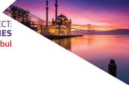
FIG Foundation Grants 2015-2017