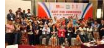
2nd FIG Young Surveyors Conference Kuala Lumpur, Malaysia