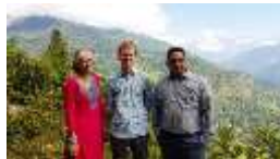
VCSP Volunteer Community Surveyors Program Kathmandu, Nepal