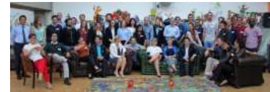
4th FIG Young Surveyors European Meeting Amsterdam, Netherlands