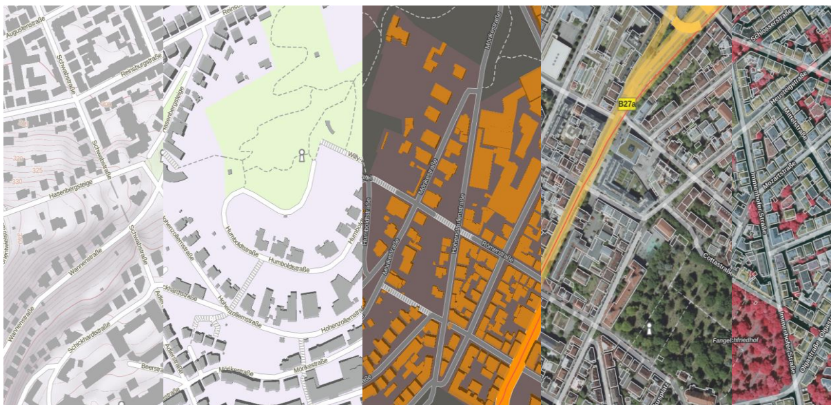
Fig. 2: Different standard styles of the web map (from left to right): relief, standard, night design, aerial photo, infrared

Compared to the previous raster web maps of the Adv (e.g. WebAtlasDE), the new vector tiles map contains also LoD1 buildings, contour lines and hillshade representation, each of course covers the entire national territory. A self-developed application (Map Editor) also provides different representations (styles) (see Fig. 2). With an editing function, any elements can be selected and highlighted, as well as any cutouts can be integrated into your own web applications as an IFrame.