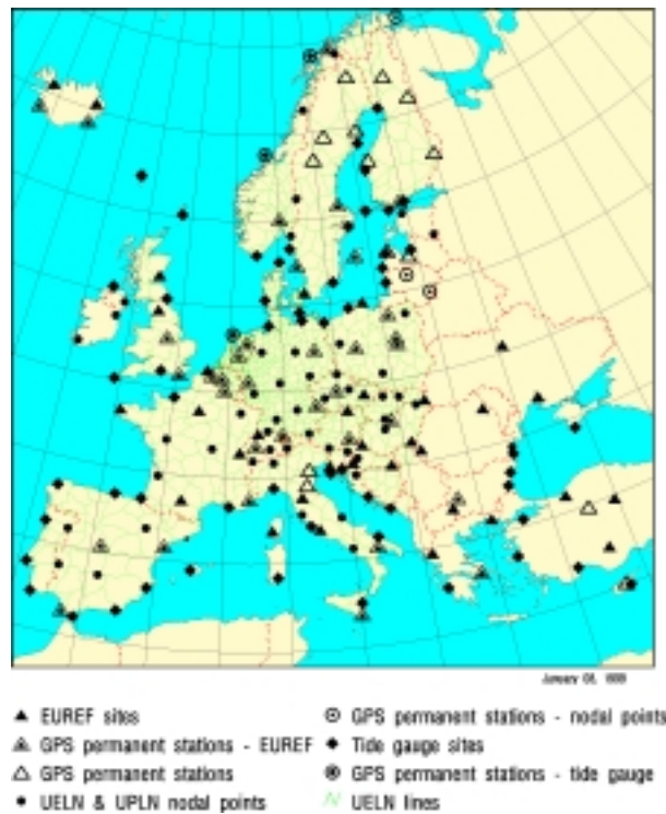
Figure 5: The European Vertical Reference Network