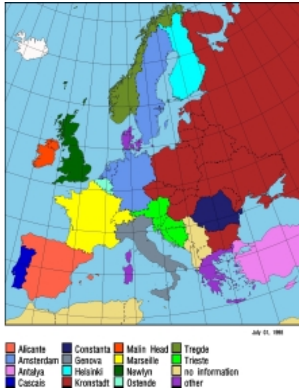
Figure 1: Reference Tide Gauges of National Height Systems in Europe