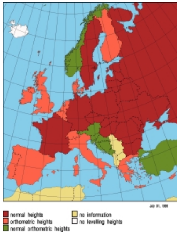
Figure 2: Kind of Heights of National Height Systems in Europe