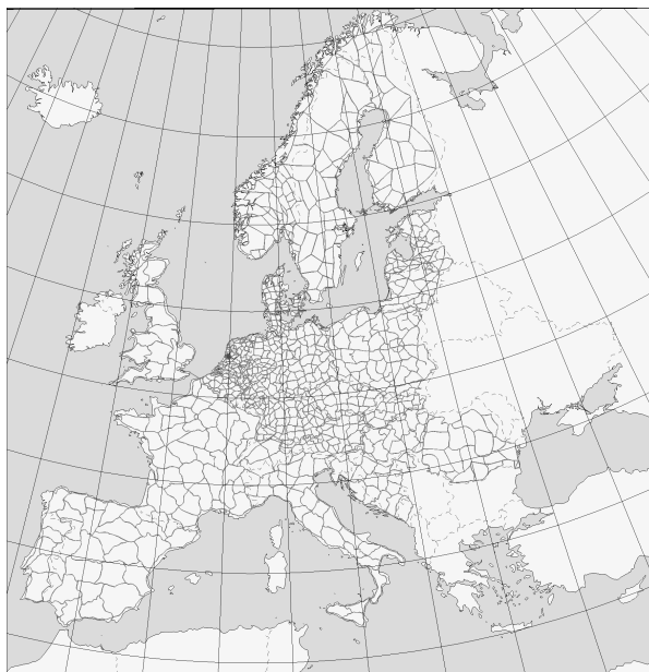
Figure 3: United European Levelling Network 1995 (UELN-95/98 – extended for Estonia, Latvia, Lithuania and Romania)

The adjustment is performed in geopotential numbers as nodal point adjustment with variance component estimation for the participating countries and as a free adjustment linked to the reference point of UELN-73 (Amsterdam).