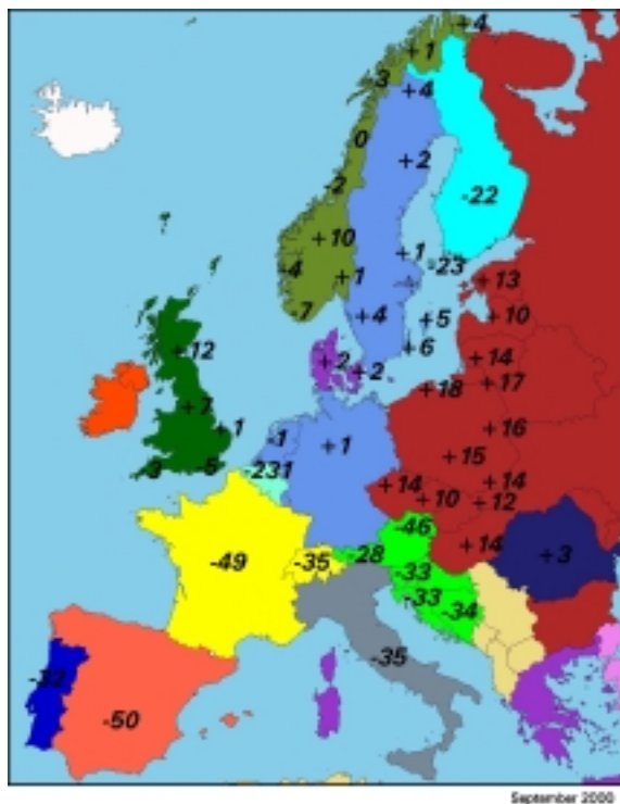
Figure 6: Differences between EVRF2000 zero level and the zero levels of national height systems in Europe (in cm)

ITRS/ITRF xx coordinates are given in the non tidal system, the EVRS heights are given in the zero tidal system.