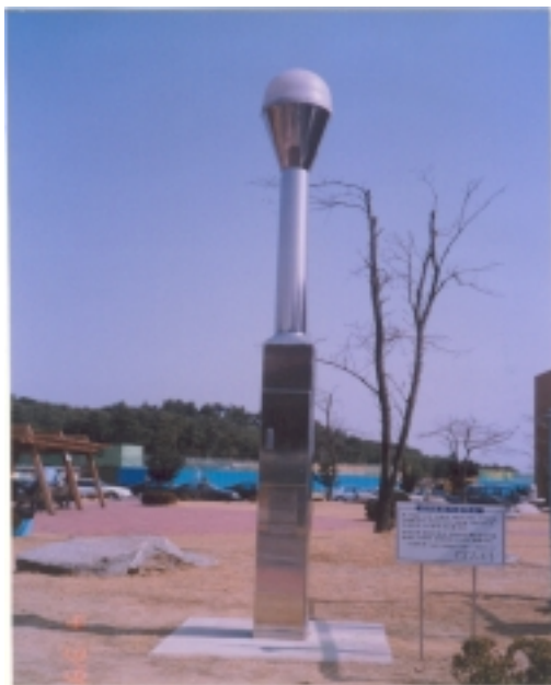
Figure 2. Typical type of permanent GPS site established by NGI