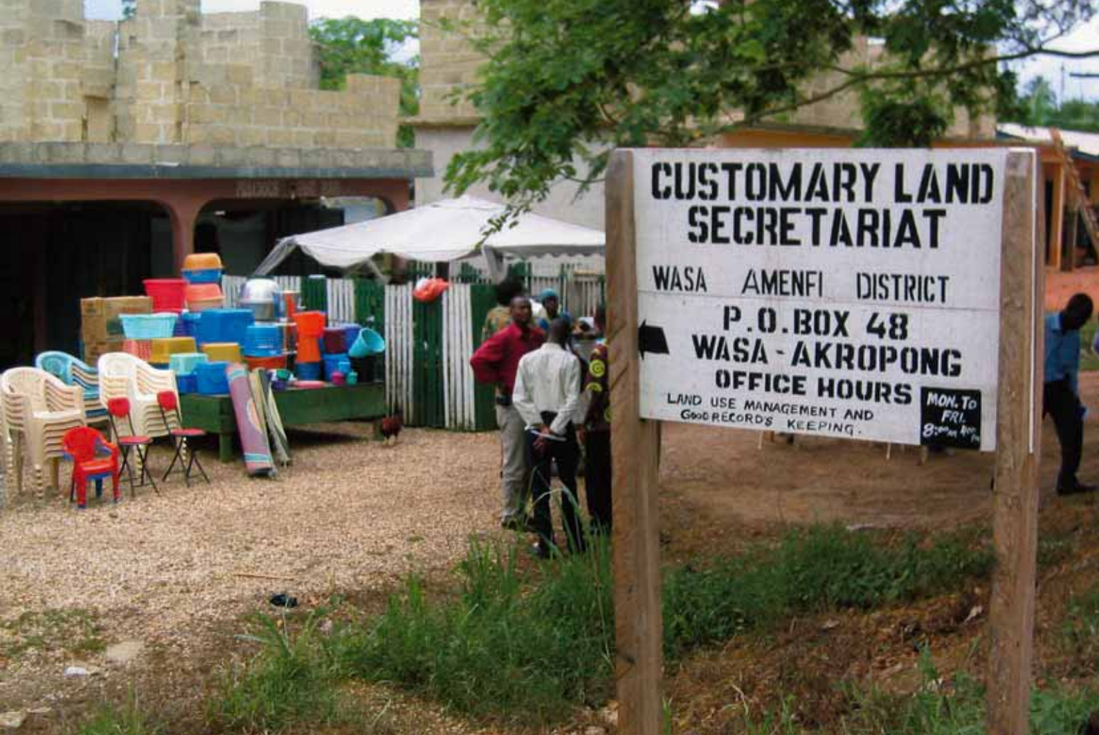
Customary Land Secretariat sign, Wassu Ghana.