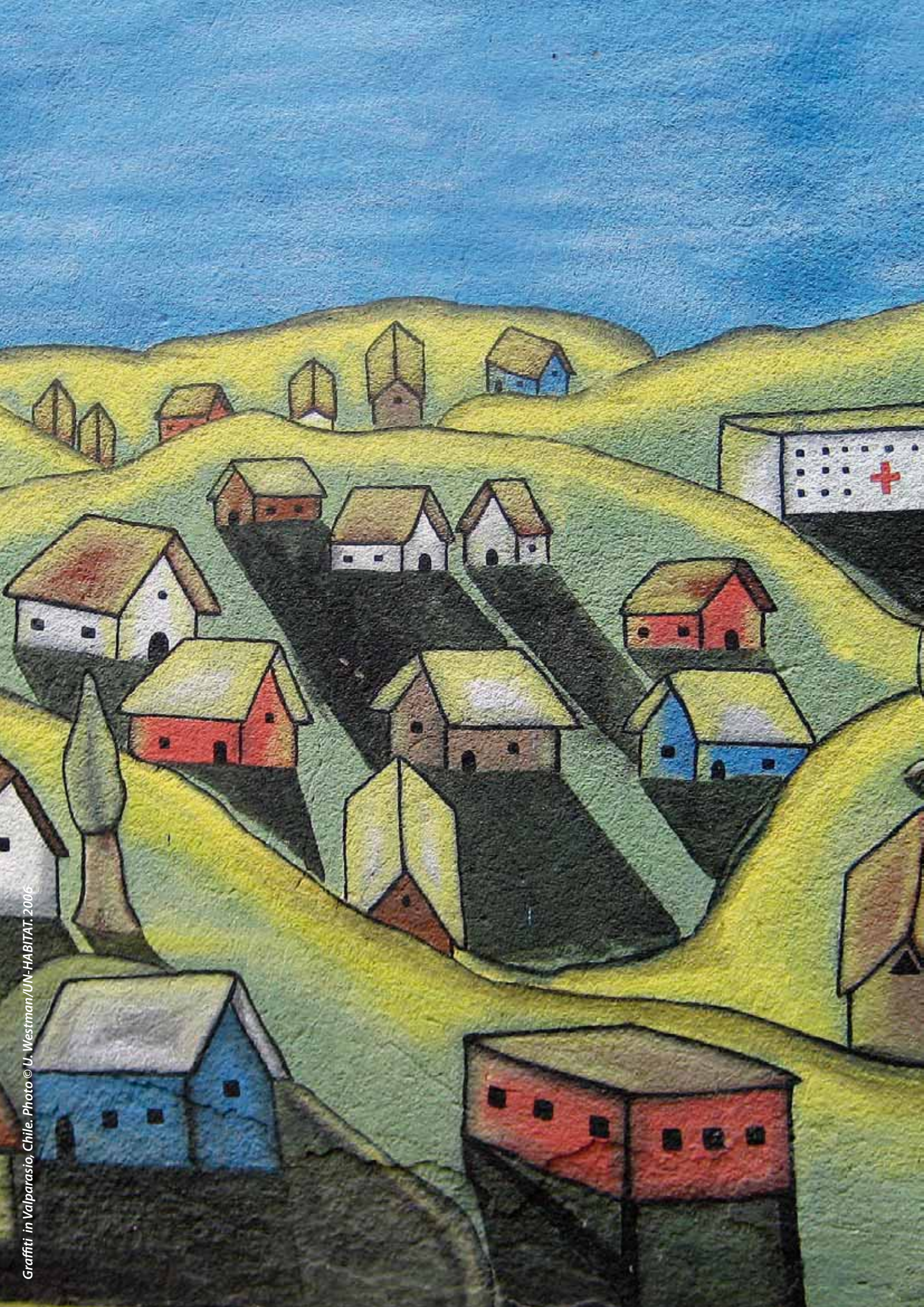
Graffiti in Valparaiso, Chile.