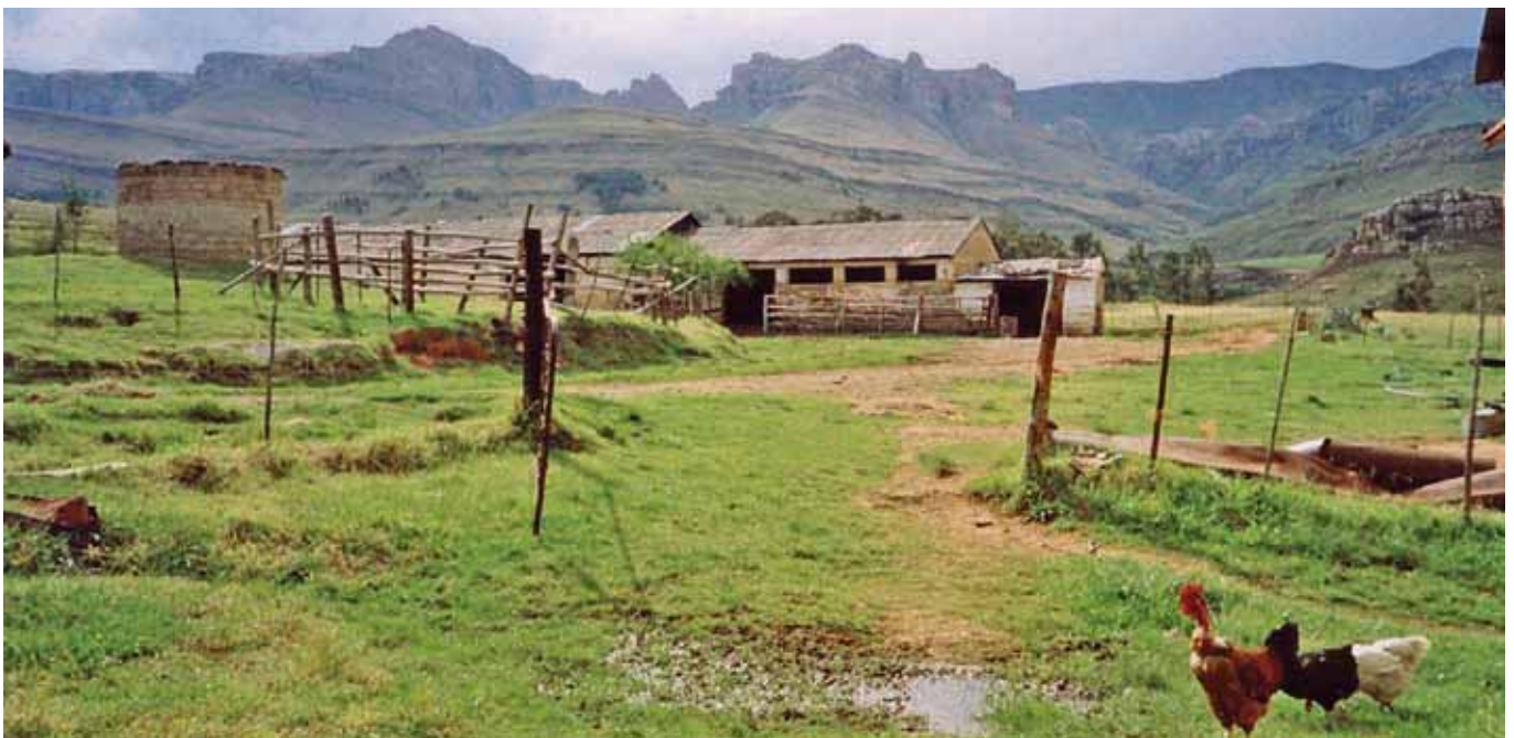
Land reform farm, E. Cape, South Africa.

Land governance must shift its emphasis away from currently dominant technical and managerial approaches to land tenure and administration, and towards approaches based on a better understanding of the political economy of land (e.g., the nature of vested interests and power relations, and their impact on land access and land rights as well as changing uses).